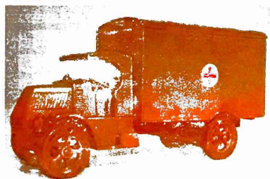
Muddy Mack 'Bulldog' ambulance

Contact info@forwardmodels.net for a complete list including WW2 vehicles.