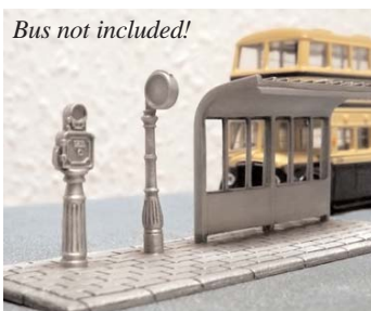
Bus not included!

Having researched original equipment at museums, we have tried to reproduce the distinctive style of bus stop, Bundy clock and 1950s shelter. Printed clock and bus stop faces are included.